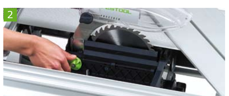
Easy access to the blade: the retaining flap is unlocked using the rotary knob; the spindle stop locks into place automatically.