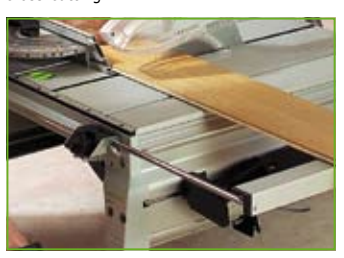
Cross-cutting up to 294 mm.