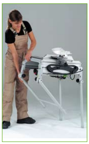
Simply fold out: firm leg clamps give dependable stability

For example, you can approach the scribe mark accurate to one millimetre , switch on, saw, switch off. And you're done. This provides safety with the highest operating comfort.