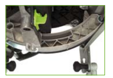
The honeycomb reinforcement is extremely durable.