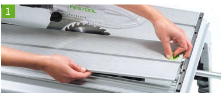
Effortless removal of the bench plate by means of integrated pressure springs.

The interlocking saw blade catch eliminates slack: the power is transferred perfectly onto the saw-blade as it draws effortlessly through the material.