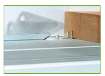
Practical: spacer wedge can be lowered.