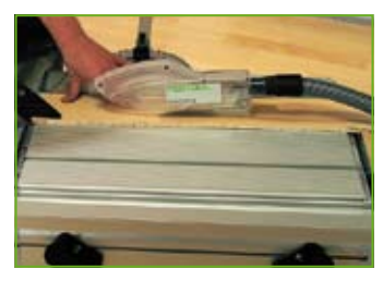
Problem-free switching from rip cuts to cross-cutting.

Simple precision is provided by the spacer wedge that can be lowered: simply press it downwards and the CS 50 is equipped for all covered cuts – without any complicated setup operations.