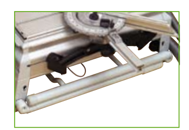
Secure on the floor: the legs can be folded away safely and easily.